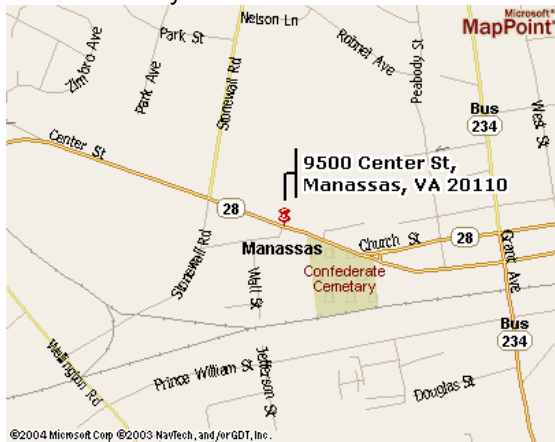
Social Security Office