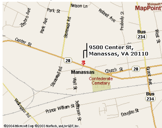
Social Security Office